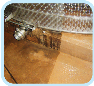
Wine / food industry