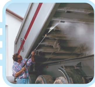
Car and Truck wash